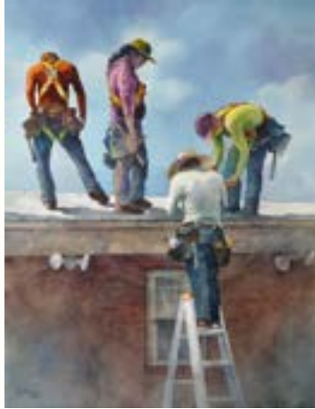
"Raising the Roof"

In addition, she was the National Exhibition juror and workshop instructor for the South Carolina Watermedia Society in September 2025.