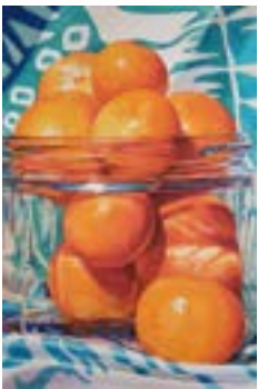
"Citrus in a Jar"